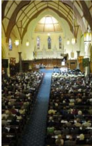
Interior view of the Scots' Church in Melbourne, Australia.